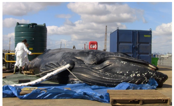
Figure 1. Humpback whale found dead in River Thames, 2009

It was also tasked with the development and population of an integrated database bringing together accurate and geo-referenced information on both strandings and post-mortem data, allowing end users to interrogate this data via the internet. A national cetacean tissue archive was also maintained and provided a useful resource for scientific research. This project commenced in April 2007 and ran until March 2011.